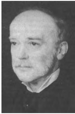
Dr. Samuel Gee

The third annual Celiac Disease Awareness Day Resolution was passed in September, 2008 by the United States Senate (S.Res. 657). This resolution, again sponsored by Senator James Inhofe of Oklahoma and Senator Ben Nelson of Nebraska, made September 13, 2008 National Celiac Disease Awareness Day. The date of September 13 was chosen because it honors the birthday of Samuel Gee, MD a British physician and pediatrician. Dr. Gee published the first modern description of the clinical picture of celiac disease and is credited with being the first to identify the link between celiac disease and diet. One of Gee's famous quotes on celiac disease is "if the patient can be cured at all, it must be by means of diet." CSA is again working with Senators Inhofe and Nelson to have Dr. Gee's birthday, September 13 th , nationally recognized as Celiac Awareness Day. CSA personally encourages you to contact your United States Senators and encourage them to co-sponsor this important resolution which helps to increase national awareness of celiac disease.